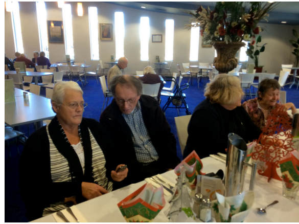
Table-hopping was a feature of the afternoon. It was great to see members not restricted by the placement of tables and chairs but moving freely around the room. At the Christmas Party, which will be here before we know it, I would expect to see even more movement between tables and courses. It all adds to the friendly, supportive atmosphere that permeates all occasions when members of the Canberra Lung Life Support Group get together.